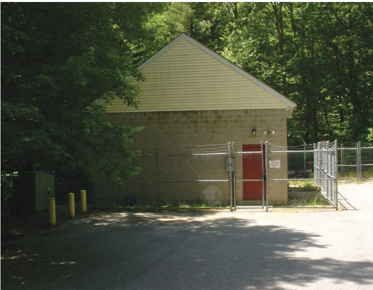
Glen Street Pump Station