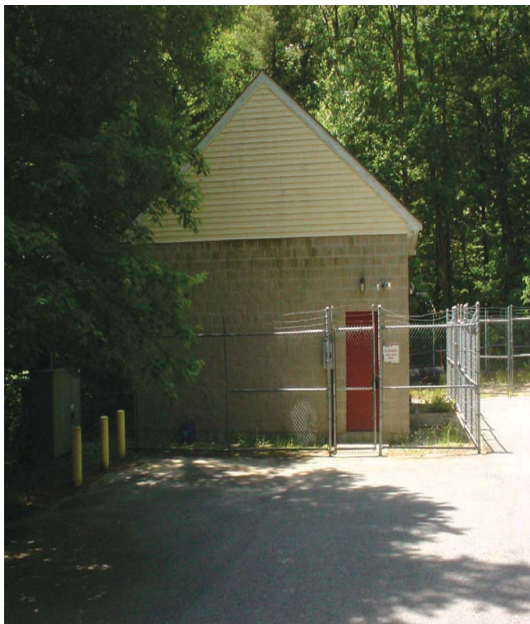
Glen Street Pump Station